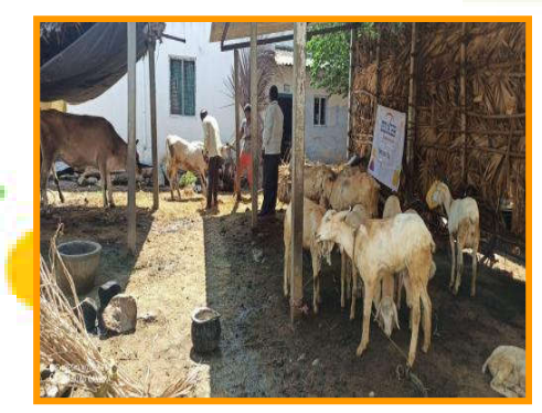
Veterinary camp at Erode