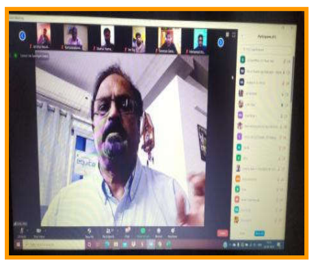
Virtual Jobfair at Chennai