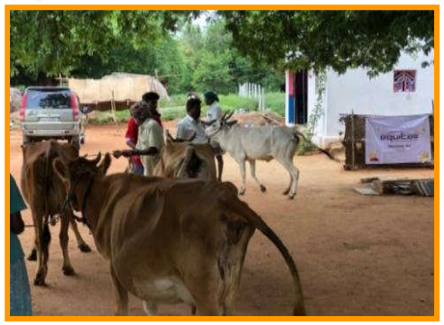
Veterinary camp at Dindigul