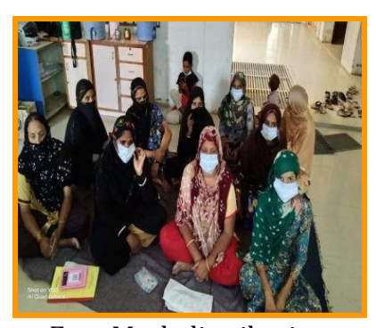
Face Mask distribution at Jodhpur