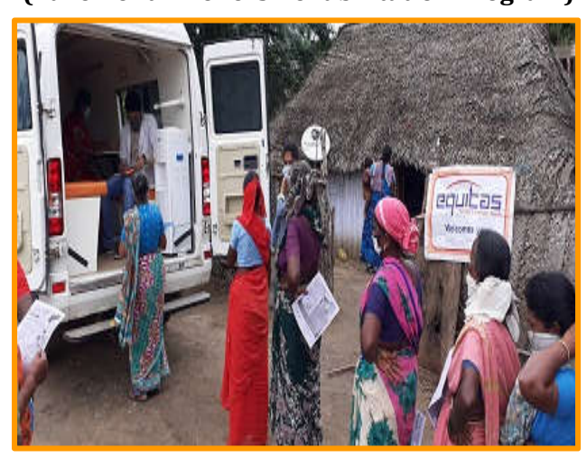
Health Camp Conducted at Minjur along with Wockhardt foundation

(Pavement Dwellers Rehabilitation Program)