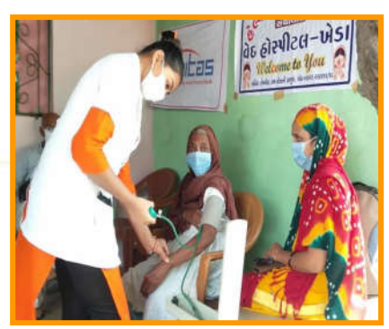
Health camp at Ahmedabad