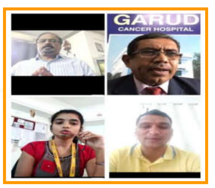
Online Cancer Awareness Program at Pune