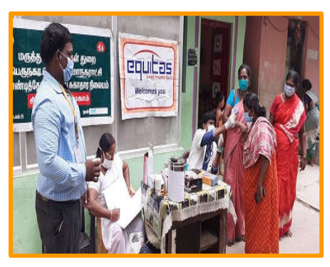
Health Camp at Chennai