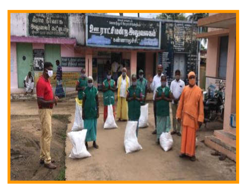
Groceries distribution to daily wage members at Salem along with Ramakrishna Mutt